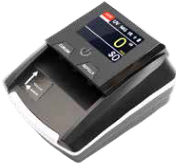
Model: COLT FND V1