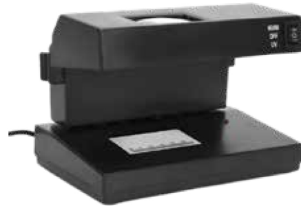
Model: COLT FND V2