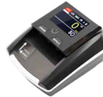
Model: COLT FND V1