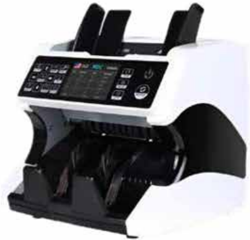
Model: MAJOR CCM V2