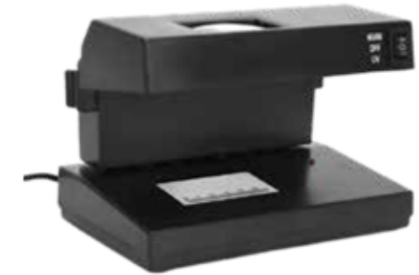
Model: COLT FND V2